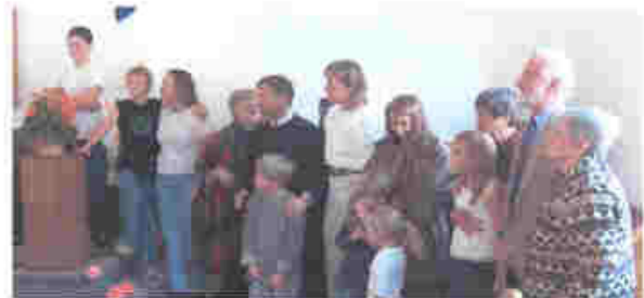
On the porch after service: